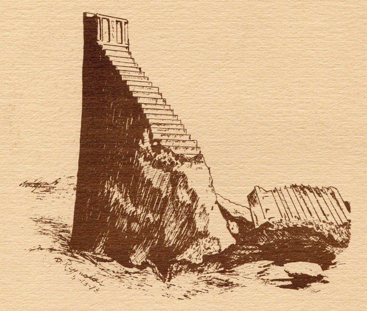
California Registered Historical Landmark No. 919