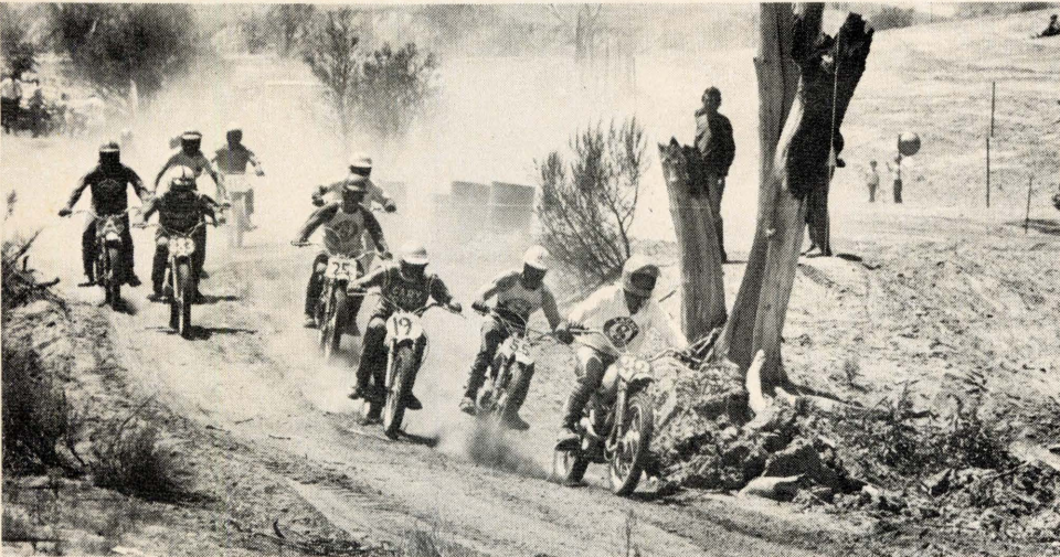
Bike riders had their own off-road course and ran simultaneously with the buggies. Riders showed their rugged stamina and skills over a course that included water hole and sharp drop-offs.