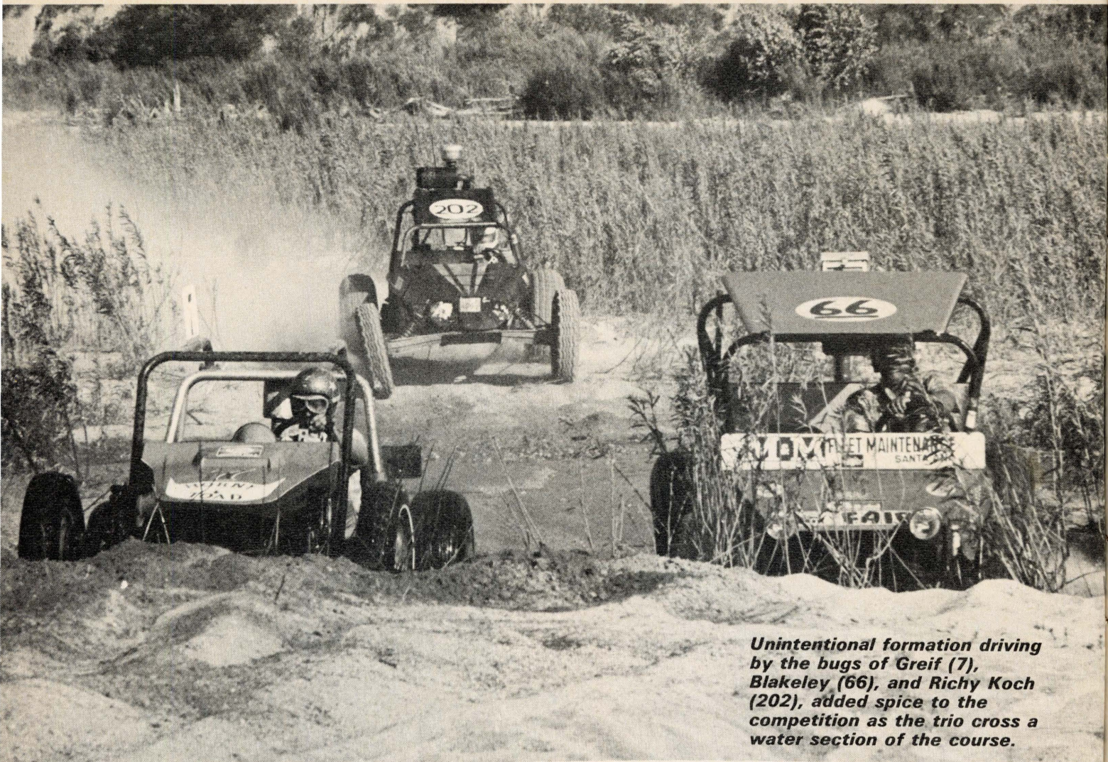
Unintentional formation driving by the bugs of Greif (7), Blakeley (66), and Richy Koch (202), added spice to the competition as the trio cross a water section of the course.