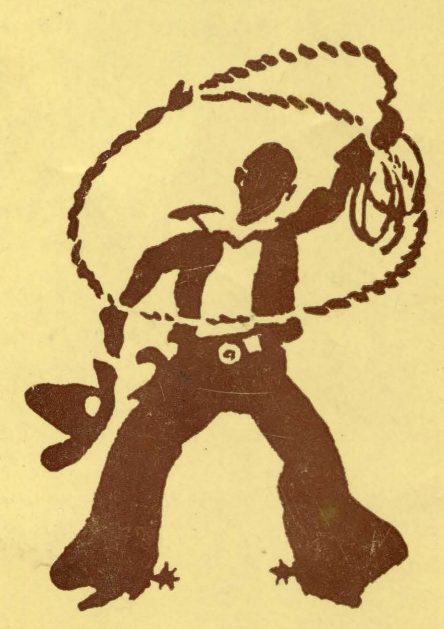
Visit Beautiful Hotel Lebec You Will Enjoy Its Comforts

In the Mountains — Sixty-Five Miles from Hollywood and Forty Miles from Bakersfield on the Famous Ridge Route between Los Angeles and San Francisco.