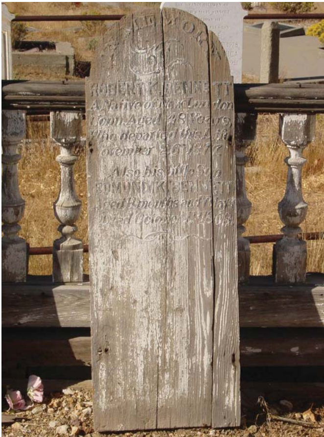
Figure 7. As shown by this 1877 marker in Silver Terrace Cemetery, Virginia City, NV, exposure to sunlight can damage wood grave markers, making the wood more susceptible to water damage and cracking.

appearance and influence wood properties. Wood-cell walls and cavities contain moisture. Oven drying reduces the moisture content of wood. After the drying process, the wood continues to expand and contract with changes in moisture content. The loss of water from cell walls causes wood to shrink, sometimes distorting its original shape (Fig. 7).