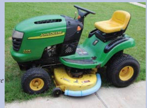
Figure B. A pool ‘noodle’ can be fitted to the deck of a lawnmower to prevent damage to grave markers.

Ongoing maintenance of cemetery vegetation is essential to conserve grave markers and fencing. Periodic inspections may warrant removing trees; trimming tree limbs, shrubs, and vines; and removing volunteer vegetation. All trees should be inspected at least every five years. Annual inspections are necessary to assess the condition of shrubs and vines, and to identify volunteer growth for removal. Mowing and trimming around the hundreds of stone, brick, iron, and wood features found in many cemeteries is a weekly or bi-weekly chore. Lawn care is the most time-consuming, and, if not done carefully, potentially destructive maintenance activity in historic cemeteries.