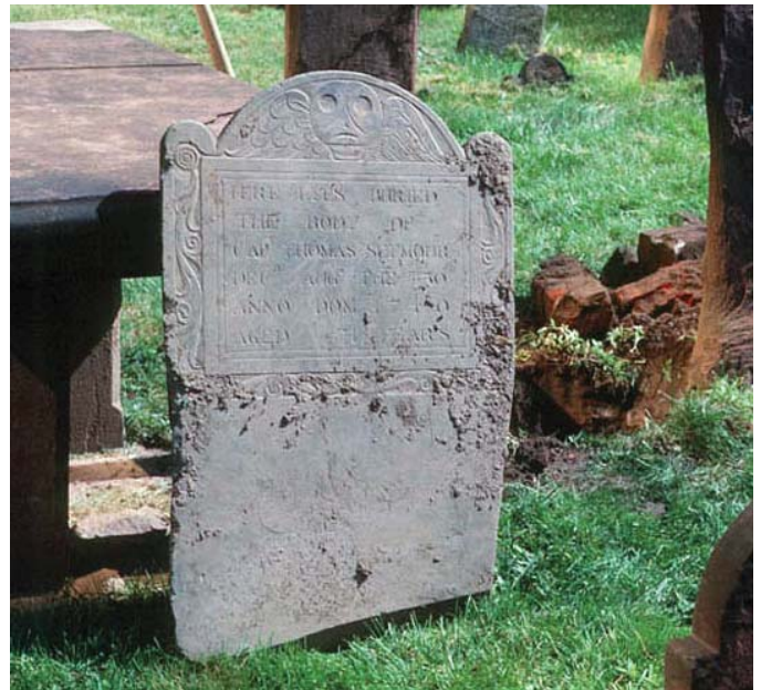
Figure 20a. This slate grave marker in the Ancient Burying Ground in Hartford, CT, is a ground-support stone. Resetting requires digging a hole that will hold the base of the stone and then compacting the soil at the bottom of the hole by hand.

Inexperienced staff or volunteers should not attempt resetting without training from a conservator, engineer, or other preservation professional. When dealing with fragile or significant grave markers, or those with large