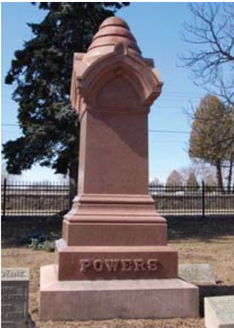
Figure 5. A variety of colors of natural stone are found in historic cemeteries, such as this pink granite marker in the Cedar Grove Cemetery, New London, CT.

the selection of materials and procedures for its cleaning and protection.