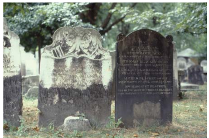
Figure 9. The limestone and sandstone grave markers in this historic cemetery have different weathering processes. On the left, the limestone shows surface loss in areas exposed to rainwater and gypsum crust formation below. The sandstone marker on the right displays uniform soiling, but surface hardening may be occurring.

All grave marker materials deteriorate when they are exposed to weathering such as sunlight, wind, rain, high and low temperatures, and atmospheric pollutants (Fig. 9). If a marker is composed of several materials, each may have a different weathering rate. Some weathering processes occur very quickly, and others gradually affect the condition of materials. Weathering results in deterioration in a variety of ways. For example, when exposed to rainwater some stones lose surface material while others form harder outer crusts that may detach from the surface.