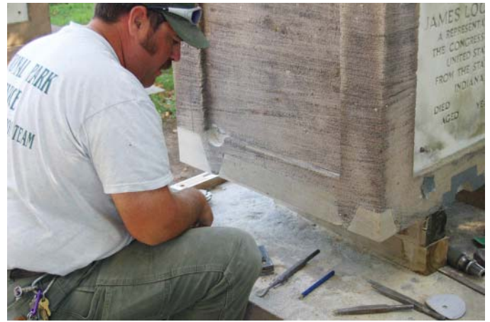
Figure 16. A professional mason works to insert a new piece of stone. Often referred to as a “dutchman”, this repair technique requires replacing the deteriorated stone section with a new finished piece of the same size and material.

The cemetery manager can use the information from the condition assessment report to develop a maintenance plan with a list of cyclical maintenance work. Many tasks can be carried out by in-house staff. For example, maintenance cleaning of metal and stonework can often be accomplished by rinsing with a garden hose. Applications of wax coatings can be used to protect bronze elements. Trained staff can undertake these tasks. Teaching graffiti removal techniques to cemetery staff may also be necessary if vandalism is an on-going problem. Staff should have access to written procedures