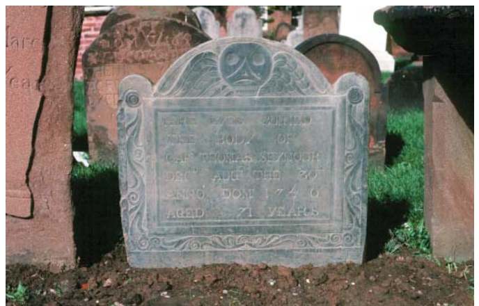
Figure 20c. The reset ground-supported grave marker should be level and plumb.