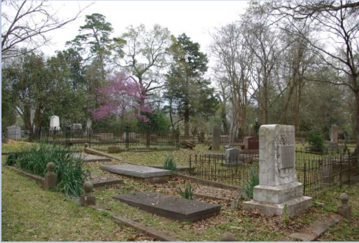
Figure A. Cemeteries are cultural landscapes made up of a variety of features. Grave markers are but one component of cemeteries that also include walkways, drives, fences, coping, trees, shrubs, and other vegetation. Each component adds to the understanding of the cemetery landscape.