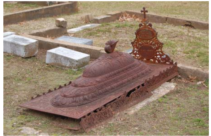
Figure 6. Decorative cast-iron grave markers like this late-19th century one in Oakland Cemetery in Shreveport, LA, are produced by heating the iron alloy and casting the liquid metal into a mold.

Metals are solid materials that are typically hard, malleable, fusible, ductile, and often shiny when new (Fig. 6). A metal alloy is a mixture or solid solution of two or more metals. Metals are easily worked and can be melted or fused, hammered into thin sheets, or drawn into wires. Different metals have varying physical