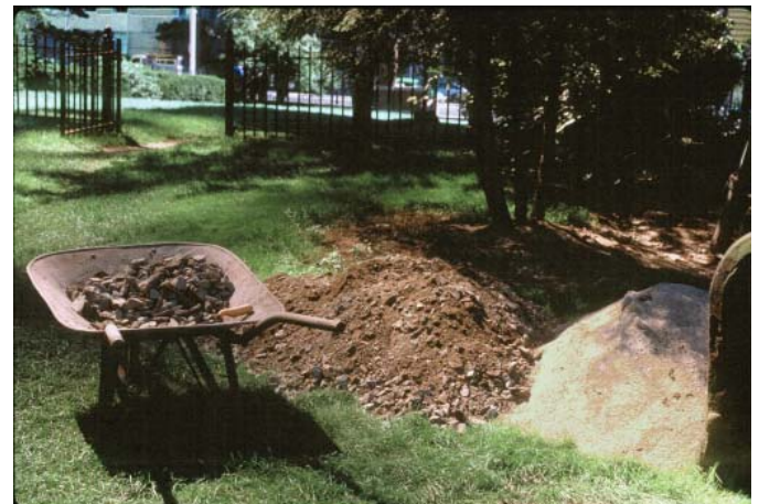
Figure 20b. To facilitate drainage, crushed stone, gravel, and sharp sand line the hole and are hand-tamped around the stone after placement.