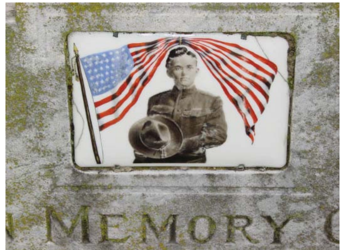
Figure 8. A fired ceramic, this cameo is set in a marble grave marker, located in Elmwood Cemetery, Memphis, TN. Different materials may require different conservation approaches.

Old cemeteries often include a wide variety of other materials not normally associated with contemporary grave markers, such as ceramics, stained glass, shells, and plastics (Fig. 8). As with masonry, metals, and wood, each has its own chemical and physical properties which affect durability and weathering. These materials